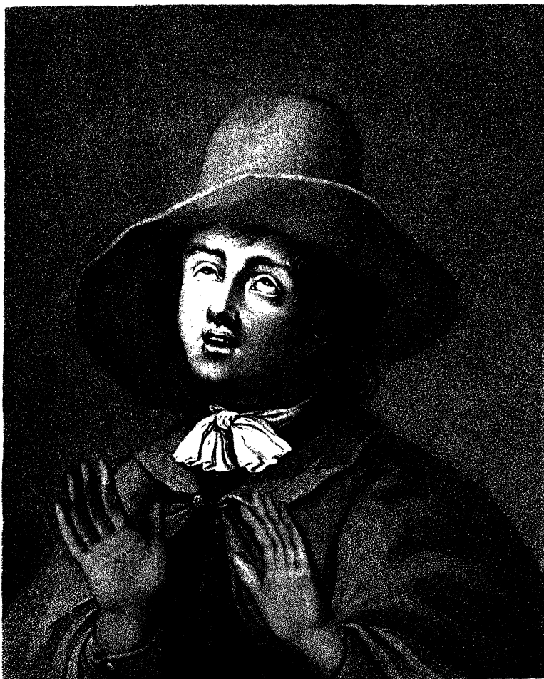
George Fox aged 30 From Holmes's engraving of Honthorst's picture Painted in 1651.